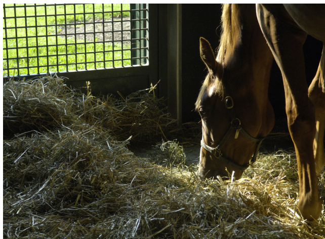
Because horses often eat off the floor and lie down when stabled, they can be exposed to high ammonia levels that lead to airway disease.

Ammonia is a small molecule composed of nitrogen and hydrogen with a characteristic pungent and unpleasant odor. Ammonia comes from urea—a nitrogen-containing molecule—that is present in urine and feces. Horses excrete urea to eliminate excess nitrogen from their bodies. While urea itself is odorless and nontoxic, it is rapidly converted to ammonia once excreted. Ammonia, unlike urea, is extremely irritating to the mucous membranes that line the mouth, eyes, and respiratory tract.