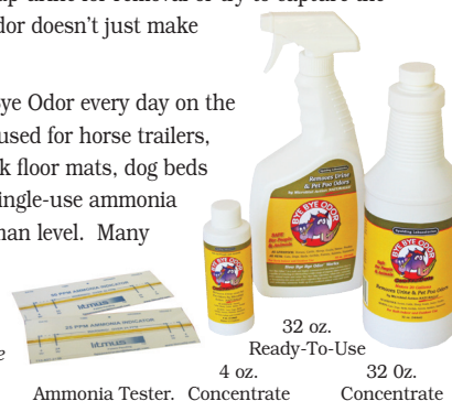
Ammonia Tester. Concentrate 4 oz. 32 Oz. Ready-To-Use Concentrate

The 4 oz. Concentrate ($19.95) makes 2.5-gallons, enough for 5 horses stalled full time for one month. For larger barns, the 32 oz. Concentrate ($119.95) makes 20 gallons, which is enough for 40 horses for one month. The one quart Ready-To-Use ($19.95) is ideal for Trailers, Pets... anywhere a quick clean-up is necessary. We recommend an ideal starter as the Ready-To-Use and the 4oz. Concentrate for just $31.90...the concentrate makes the equivalent of 8 Ready-To-Use Bottles!